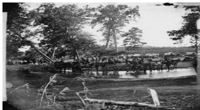
Timothy O'Sullivan, photographer, captured Federal Artillery on the way to the battle, August 9, 1862.

CULPEPER, VA. OCTOBER 11, 2020 RAIN OR SHINE OPEN TO ALL BREEDS AND DISCIPLINES