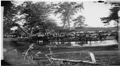
Timothy O'Sullivan, photographer, captured Federal Artillery on the way to the battle, August 9, 1862.

The trails are mostly gravel. Shoes are recommended for the horses. The trails are in the mountains with some hills. You may pass by cows in pastures next to the trails. This ride is on old Civil War battle ground with much history. We will have literature to explain the history of the area and tell you some of the things you will be passing by.